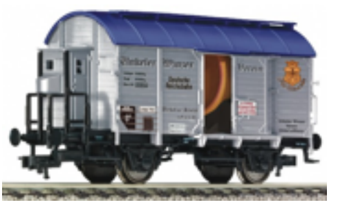
DRG Wine Tank Wagon # <u>545508</u>. An extremely popular car style!

DRG Gondola loaded with truck/flak gun # <u>522701</u>. (Military vehicles always sell out quickly).