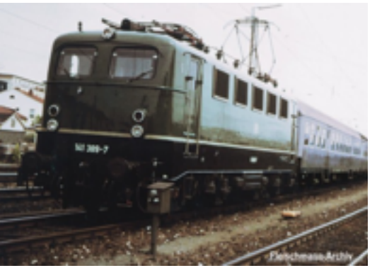
DB BR 141 Electric Locomotive – now with 5 Pole motor & dual flywheels, LED Lighting and numerous new details. . The DC version is # <u>432802</u>; DCC W/Sound #<u>432872</u> and for Marklin AC Digital w/Sound # <u>392872</u>.

On the locomotive front, a long sought after improvement for rail conductivity comes in the form of a power capacitor that is being built into new locomotive construction. SO, for locomotives outfitted with one of thee capacitors, no more stalling over dirty tracks or short circuits tracks, simply keep on driving. This will begin with the E 160 Electric locomotive DCC w/ Sound # <u>436073</u> and for Marklin AC Digital w/Sound # <u>396073</u>. Both models will have digital uncouplers as well.